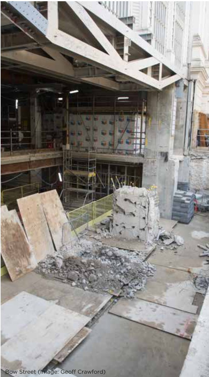
Bow Street

Last month an exciting (and for some, rather nerve-wracking) milestone was passed on the Open Up project at the Royal Opera House. Central to the project is the principle of opening up the building to make it more welcoming and accessible to visitors throughout the day and evening.