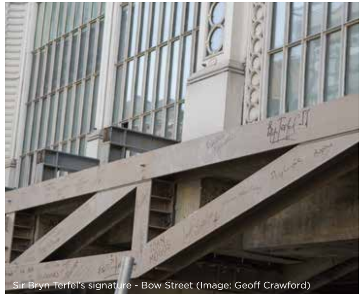
Sir Bryn Terfel's signature - Bow Street

To allow the piers to be removed, a large transfer truss spanning 17 metres and weighing a hefty 14 tonnes was carefully installed to take the load of the building above. Many of us took the opportunity to sign the truss once it was installed – including a few well-known friends!