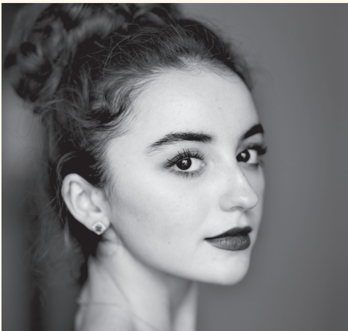
This is a picture of the dancer

Clara is a young girl who receives a Nutcracker doll as a gift from her uncle at Christmas. She is compassionate and brave.