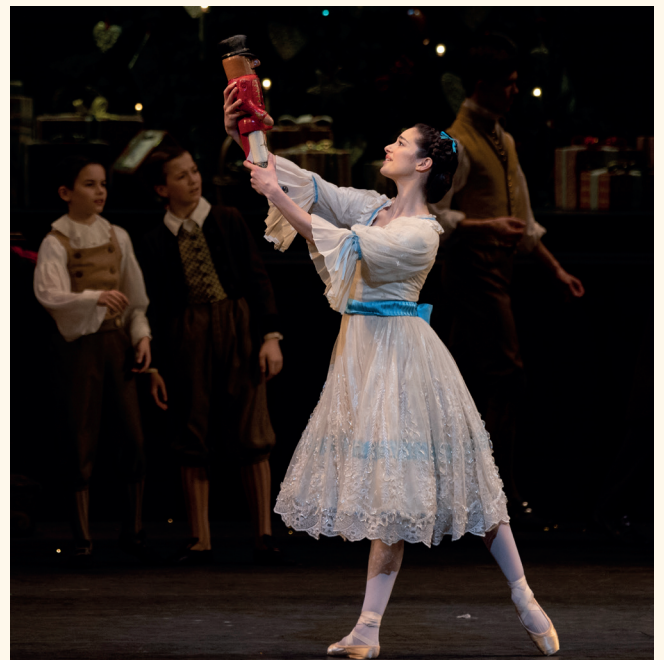
This is what the character will look like in the show