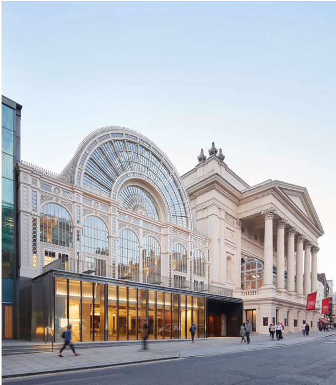
Bow Street Entrance

We can get into the building using two different entrances.